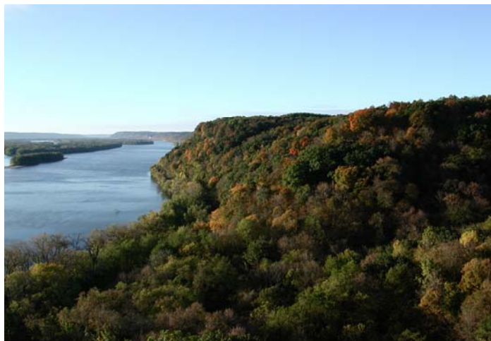
AN EFFIGY MOUNDS NAT. MONUMENT SCENE IN THE NORTH EAST CORNER OF THE CLASSIFICATION MAP VIEWING SOUTHERLY ALONG THE MISSISSIPPI RIVER